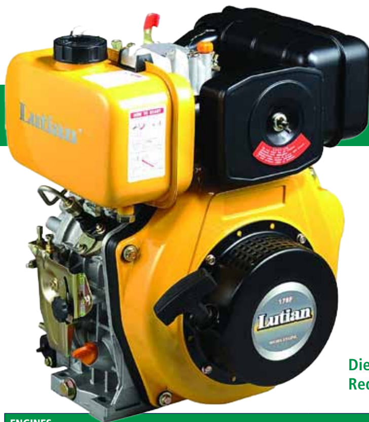
Diesel 2:1 Reduction (Concrete Mixer Engine)