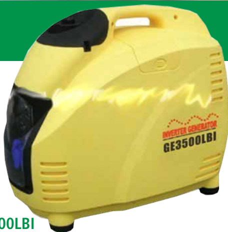
GE3500LBI Inverter Generator