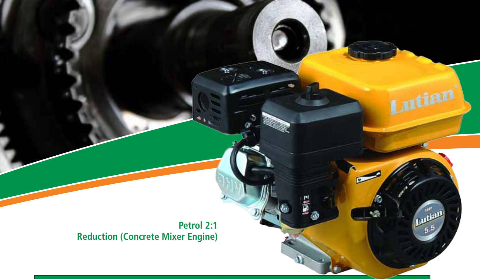
Petrol 2:1 Reduction (Concrete Mixer Engine)