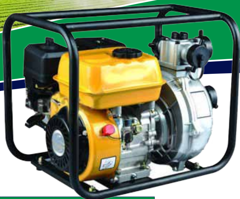
High Head Pumps