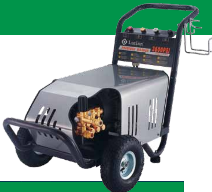
Electric 380v High Pressure Cleaner