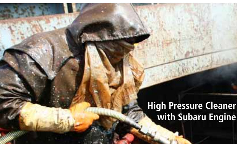
High Pressure Cleaner with Subaru Engine