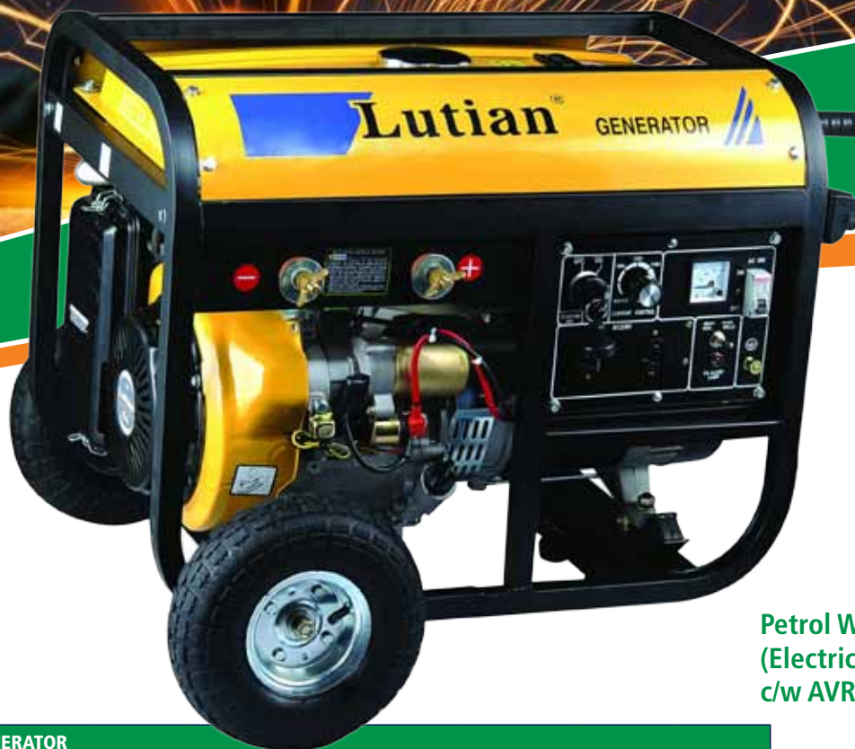
Petrol Welder/Generator (Electric Start) LTW-190B c/w AVR on generator