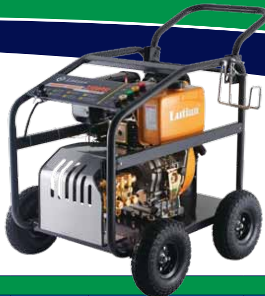
HIGH PRESSURE WASHERS - DIESEL POWERED HP PUMPS