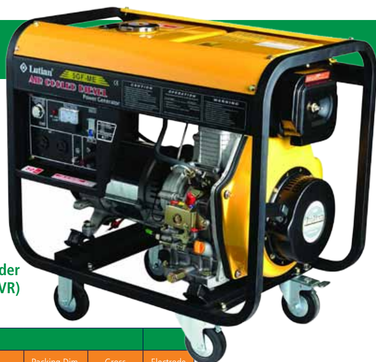
5GF-MEW Diesel Welder (generator with AVR)